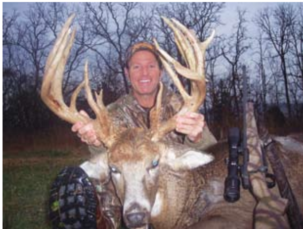
This deer taped at 215 3/8 inches in 2008.

When I first looked at him through my binoculars, I thought I was looking at an elk!