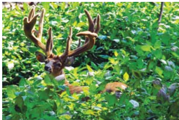
Eric Fletcher’s 270-inch whitetail in the “Magic Beans” while still in velvet.

challenging shot. Losing daylight fast, I had to adjust my scope down in power to gather as much light as possible. I touched off a round from my trusty Weatherby and the big buck stumbled off into the woods. We found him about 30 yards into the woods and began the process of loading him up in the dark. This second buck ended up measuring 233 inches.”